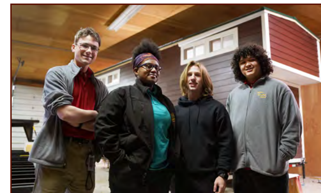
Eighteen MHS carpentry students built a tiny house from the ground up for the Hersheypark Camping Resort.

HE&R works with MHS to provide students with a variety of career-infused activities, including networking events, mock interviews, career fairs, and guest speakers. Middle Division students accelerated their learning by shadowing HE&R employees. Elementary students participated in Career Mondays, a new initiative to expose pre-K through fourth-grade students to the full range of career options. 🍌