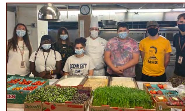
The Hotel Hershey purchases produce grown by MHS students to serve at its acclaimed restaurants.