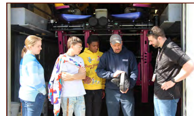
Hersheypark became an experiential classroom for eighth graders learning the importance of physics in roller coaster safety from HE&R engineers.