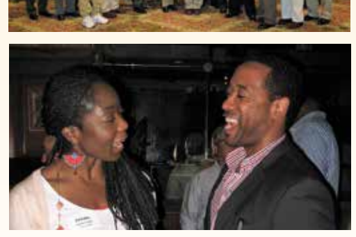
From top to bottom, here are photos from Boston, Philadelphia, Florida and New York City.

Visit mhsalum.org to view other photos from alumni events and programs held throughout the year.