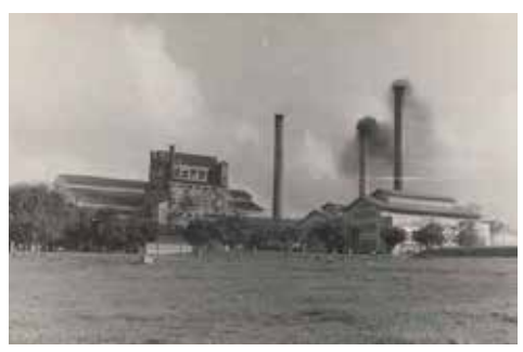
View of the mill

The special exhibit will be on display until 2019. Entry into the exhibit is included with admission to the Museum Experience at The Hershey Story. Admission is free to members of The Hershey Story. For information about museum hours and admission fees, visit hersheystory.org.