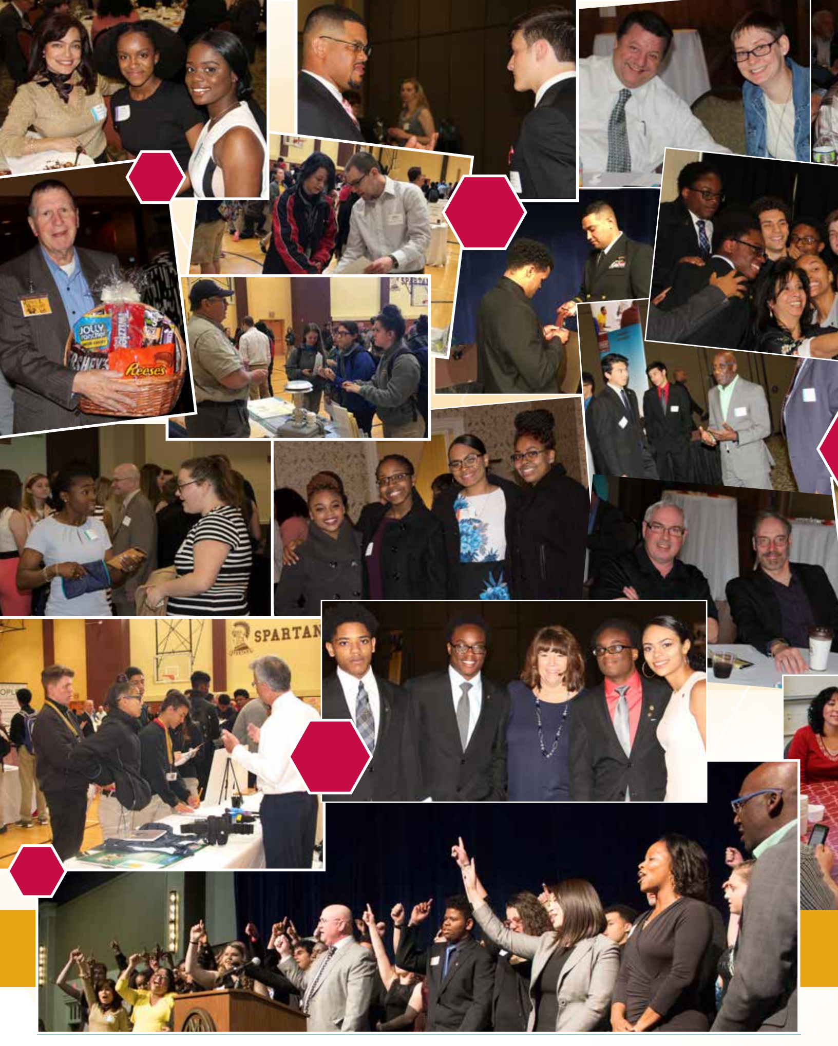
Additional photos online at mhsalum.org